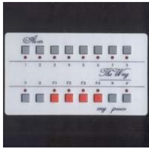
16 Channel System